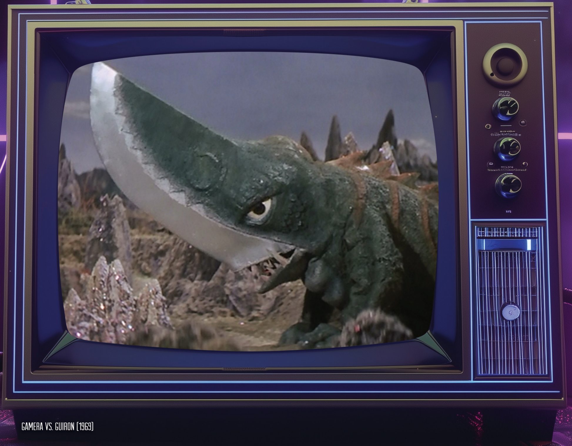
GAMERA VS. GIRON (1969)