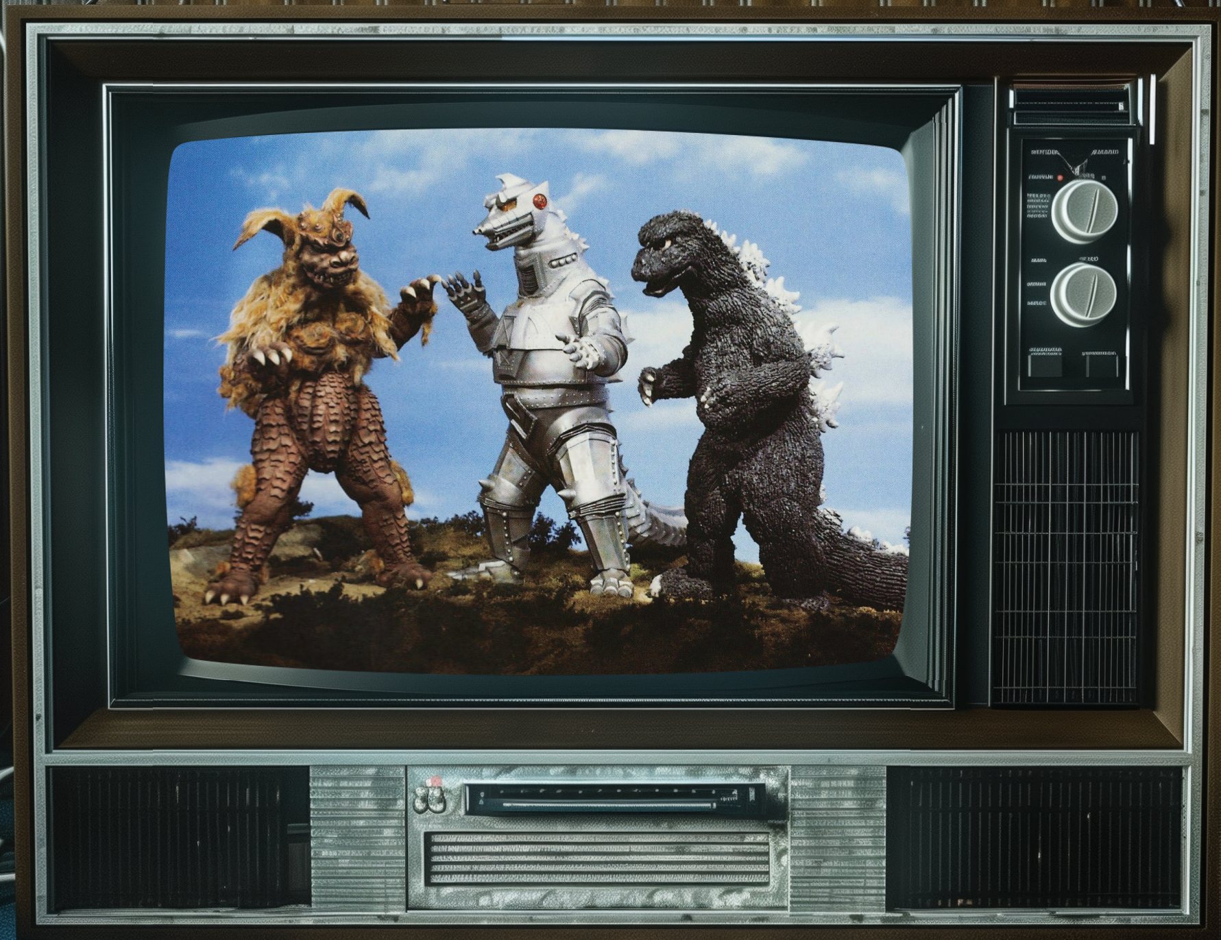
GODZILLA VS. MECHAGODZILLA (1974)