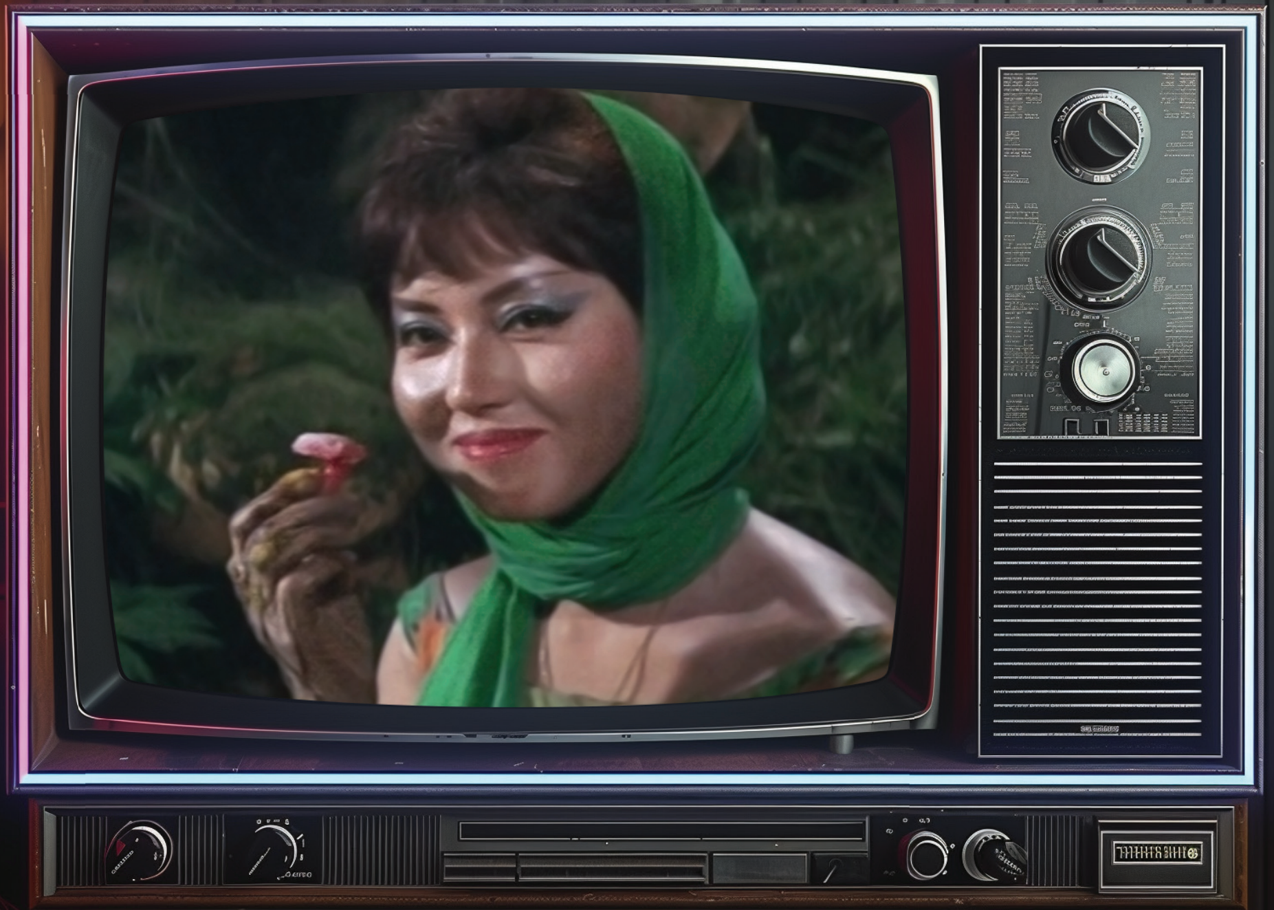
ATTACK OF THE MUSHROOM PEOPLE (1963)