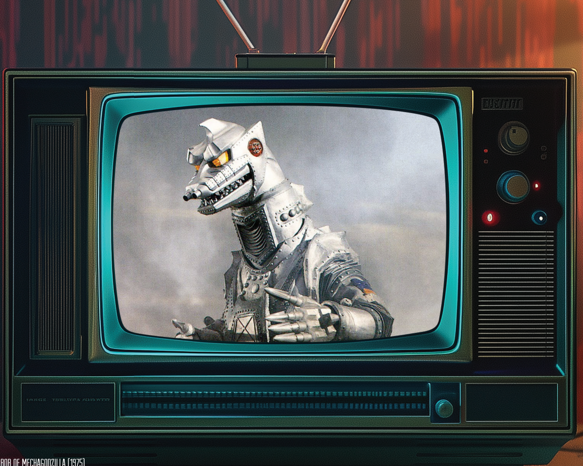
TERROR OF MECHAGODZILLA (1975)